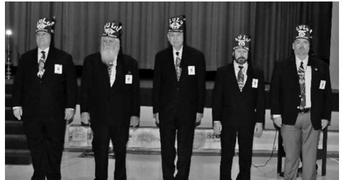
LuLu Shriner Divan 2023.